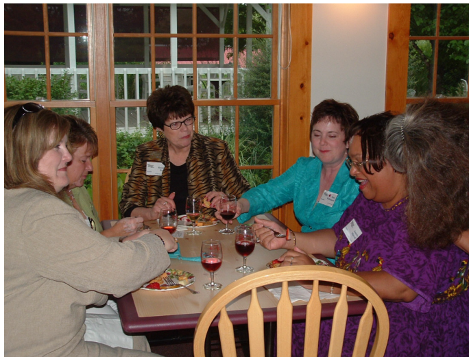
Speed networking in action.

Ready, Set, Go! Talk all you can in 2 minutes about your business and your best business building idea....Now get ready to listen for 6 minutes from three other people about the same thing. Take notes! Learn lots! Share some more! Now, do it seven times in a row!